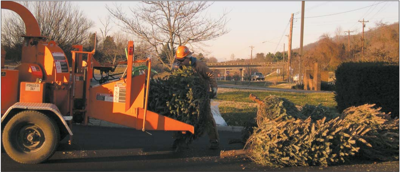
Discarded Christmas trees are ground into useful mulch instead of being dumped into the landfill.