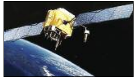
A stationary satellite provides a location coordinate to any place on earth.